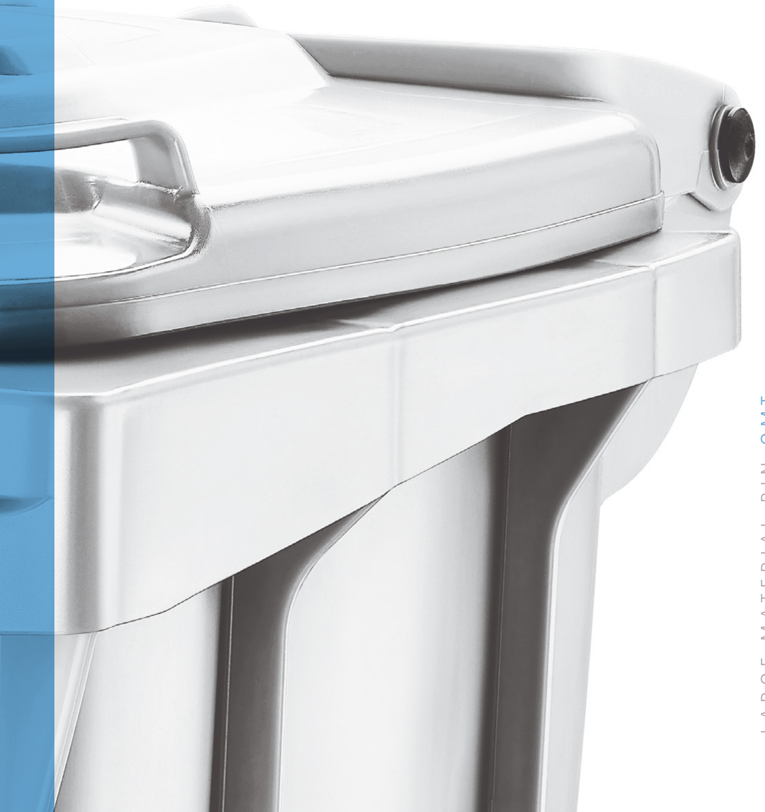
LARGE MATERIAL BIN GMT